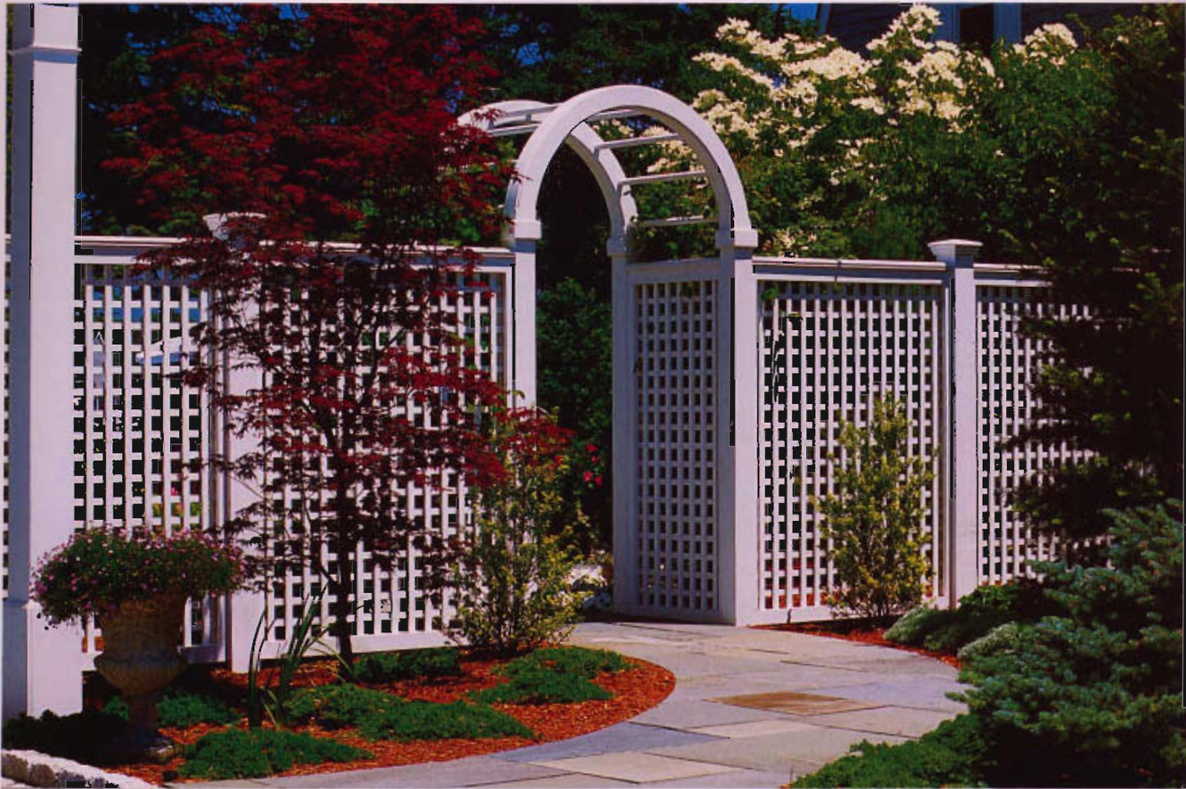
Landscaping obscures the view in or out of this elegant Walpole Woodworkers lattice fence.