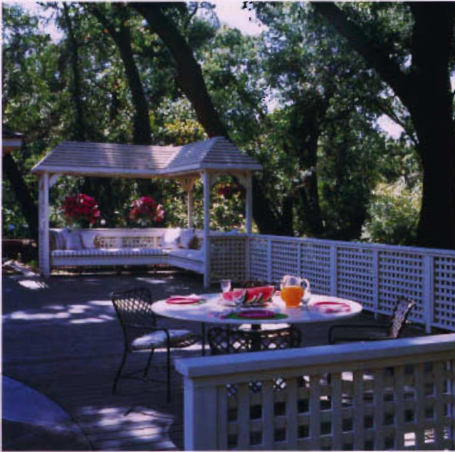
Classic redwood lattice panels surround the deck.