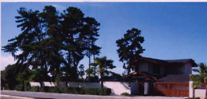
The matching garden and drive gates also create some much-needed relief.