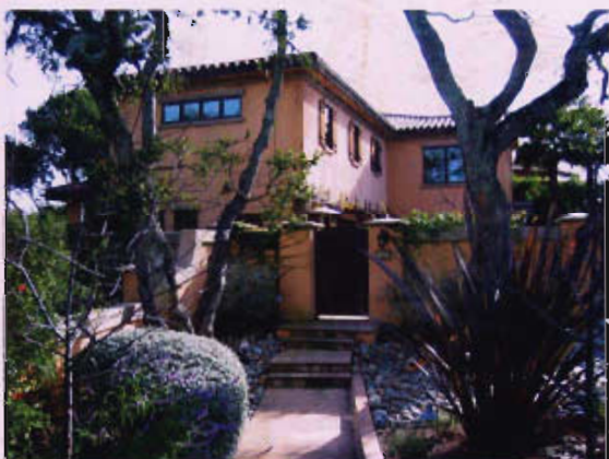
A solid masonry wall flanks this solid garden gate designed by Charles Prowell Woodworks.