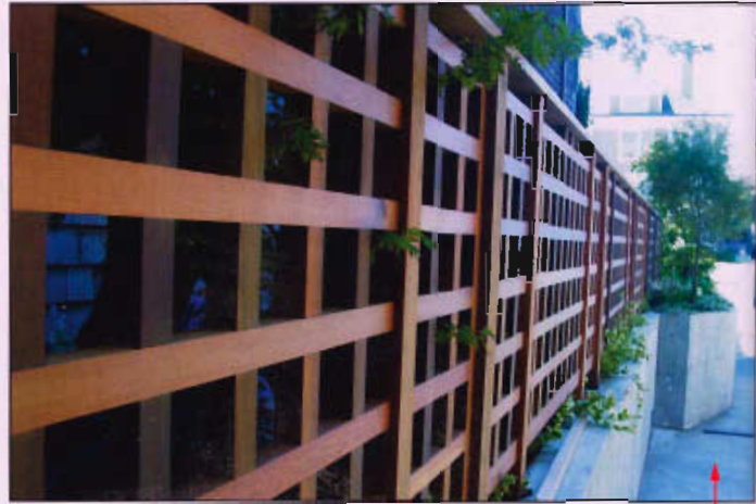
The disparity between a lattice fence and a flush-joined grid are exemplified in this Charles Prowell Woodworks' original.