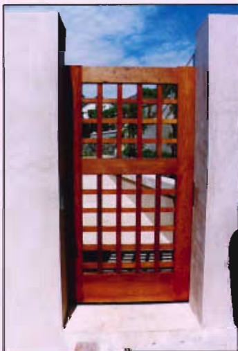
The gate to the sprawling back terraced vegetable gardens invites passers-by to pause and peer within the fortress of the surrounding privacy wall.