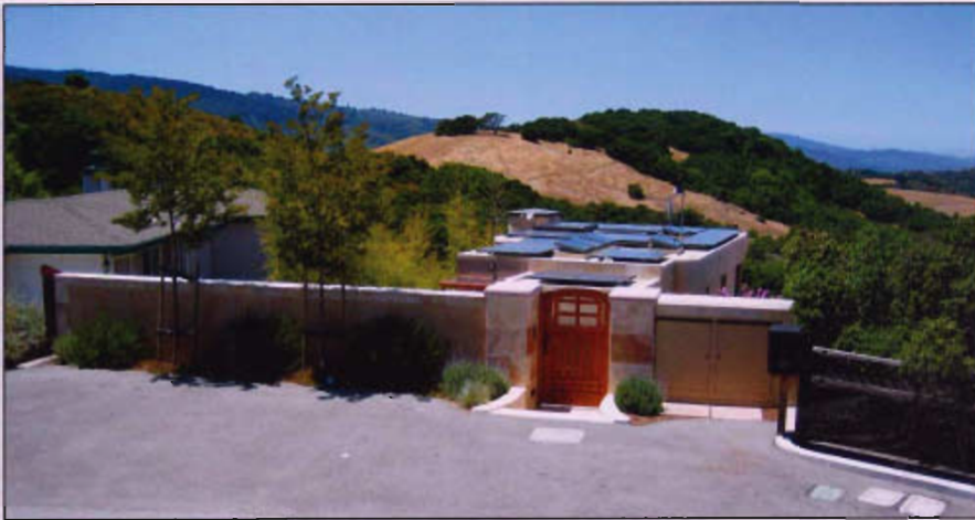
This garden gate by Charles Prowell Woodworks complements the long stucco boundary wall.

When you consider your outdoor area from a vertical perspective, you have endless opportunities to be creative.