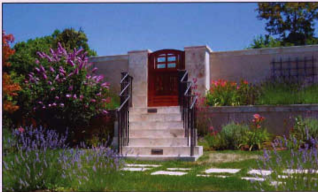
When approaching the property, you have this view. Note the terraced design of the walls.