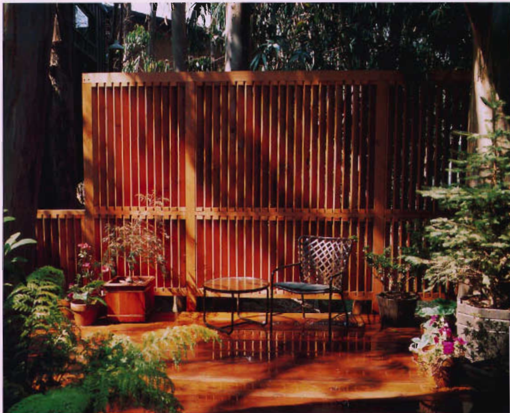
This privacy screen adds visual interest to the back yard. The louvered construction is a sophisticated way to let in light and breezes while maintaining privacy.