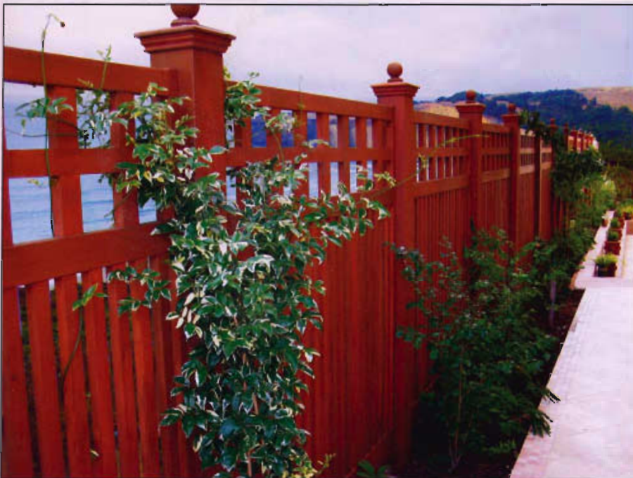
This Charles Prowell Woodworks original is a landscape-friendly design of lower mortised pickets and upper joined grids. Courtesy of Charles Prowell