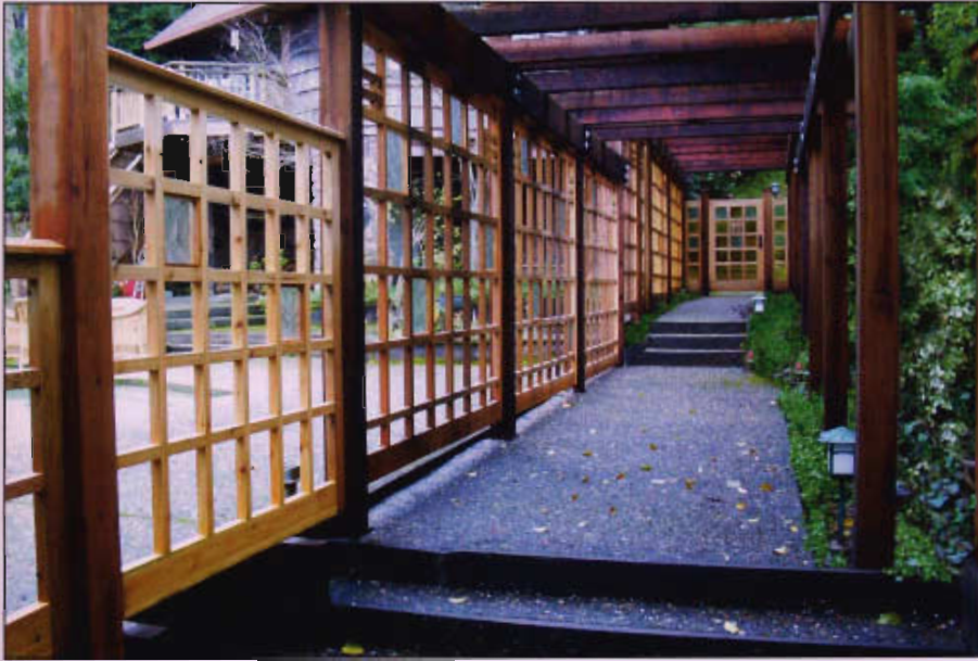
The corridor of open grid panels created by Charles Prowell Woodworks are scattered with etched glass to create a defined entry.