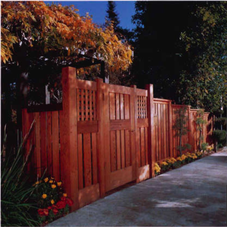
Blending with an existing arbor, this simple post and rail style fence offers both security and elegance. Design details such as the kickboard and the cap rail create visual interest.