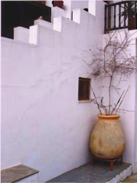
These walls have a Mediterranean feel.