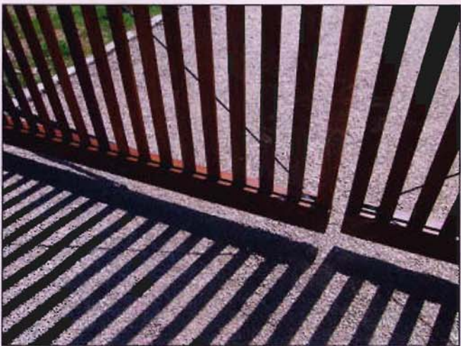
Summer sun and the driveway entrance gate create interesting shadows.