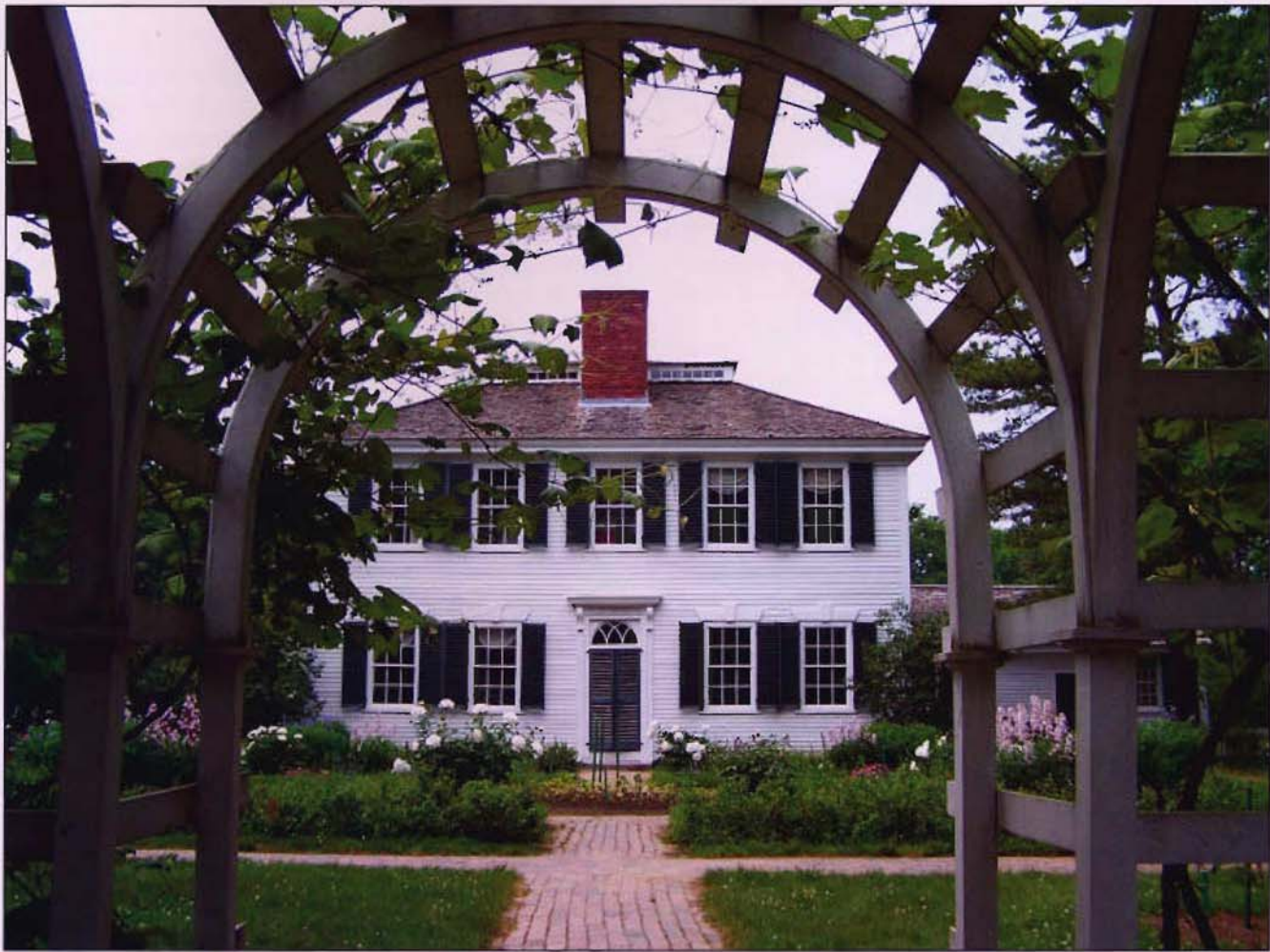
A lovely entrance. Old Sturbridge Village photographed by Angela Kearney, Minglewood Designs. Used with permission of Old Sturbridge Village.