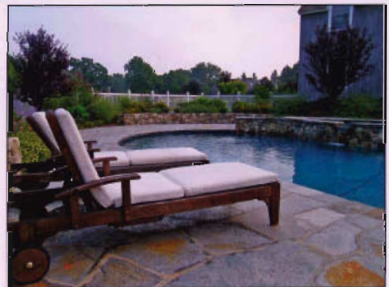
A perennial garden of orchestrated bloom and a safety fence enclose this poolside.