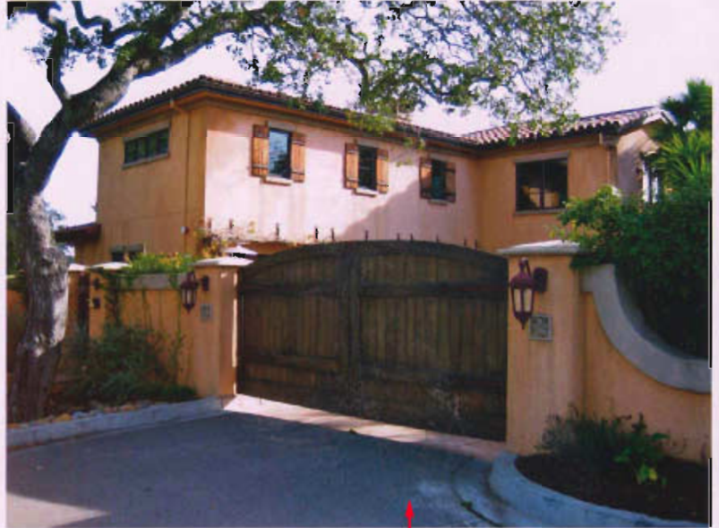
In an effort to offer both privacy and aesthetics for a renowned novelist, Charles Prowell Woodworks added some ironwork to the gate to complement the Mediterranean architecture.