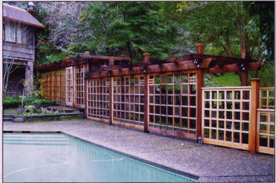
To demarcate the boundaries between an entry foyer and a pool terrace, Charles Prowell Woodworks designed repeating open grid panels and gates to diffuse the weight of the overarching arbor.