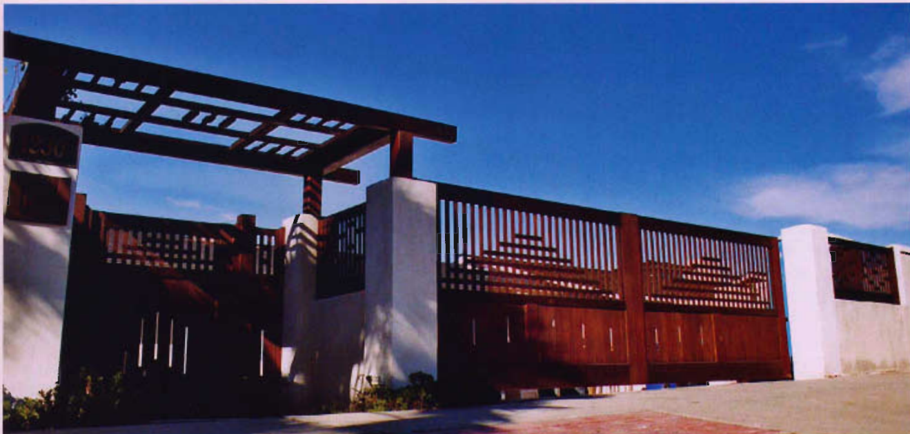
A solid privacy and sound wall encloses this sprawling property. To reduce the impression of an unfriendly fortress, the wall is relieved with an occasional Charles Prowell Woodworks fence panel. Courtesy of Charles Prowell