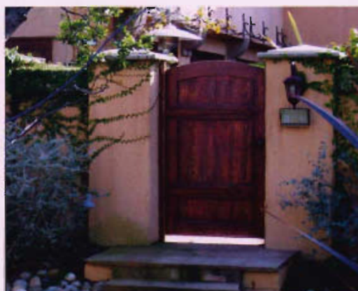
The climbing vines adorn the walls, adding a softening touch.