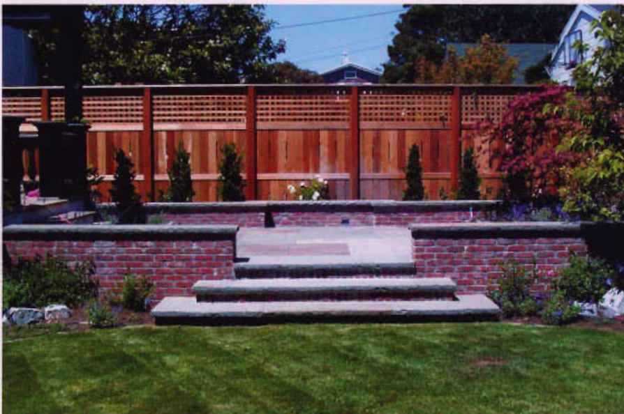
This Charles Prowell privacy fence is sectioned into two lower levels of solid floating panels. These are showcased with a flush-joined upper grid, serving to soften the sheer height of a nine-foot barrier. Courtesy of Charles Prowell