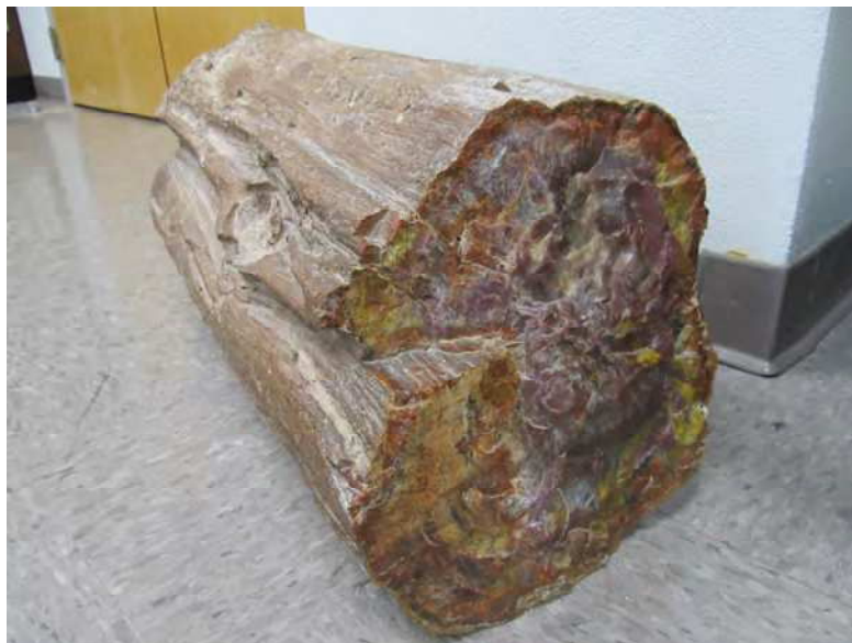
Fig. 4. The Dunn-Seiler Museum at Mississippi State University displays several specimens of petrified wood, including this fossilized log that is available for hands-on investigation.