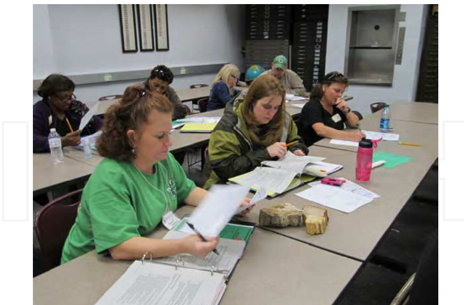
Fig. 7. Teachers in the TANS1 geosciences group compare samples of modern and petrified wood in February 2011.