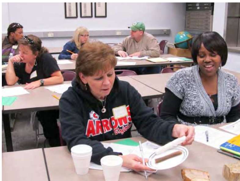
Fig. 9. Inservice teachers in the TANS1 geosciences group investigate the petrified paper activity. In this photo, teachers are trying to determine why a sample “log” made from coarse brown paper did not dry properly when compared to the petrified paper log.

In June 2011, we surveyed teachers who participated in a different professional development program, which consisted of four weeks of instruction for the integration of mathematical and science content. Ten elementary teachers participated, and constitute the group ELE1. The Petrified Wood Survey™ was administered, and fossilized and modern wood samples were provided for comparison. Because of time limitations, the full hands-on investigative activities were not conducted.