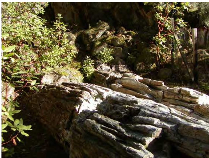
Fig. 2. The Petrified Forest in Calistoga, CA is noted for the drusy quartz crystals within the fossilized wood specimens. Brochures are used in lieu of signage at this site. A tourist site since 1871, the Petrified Forest displays fossilized wood from the Pliocene, approximately 3 million years in age.

The fact that both forests have drawn the public since 1871 (California) and 1854 (Mississippi) provides convincing documentation of the value of petrified wood and petrified forests for teaching geobiological literacy. Our investigation into the visitors' comments (Fig. 3) revealed that although visitors were awed by the display of the fossilized trees, several visitors invoked non-scientific views to explain their formation and presence at the site.