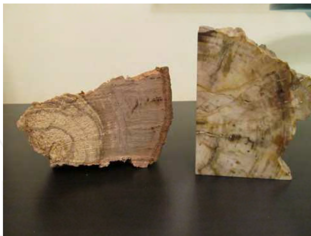
Fig. 5. Teacher groups were provided hand samples of cut and polished petrified wood (right) and a cut modern log (left) for comparison.

Because not all teachers have direct access to petrified wood samples, we introduced and field-tested a simple activity to mimic the fossilization process that involved Epsom salts and a paper towel. We provided teachers with a simple laboratory procedure from TOPS Learning Systems (n.d.). On a small plate, 14.7 cm 3 of MgSO 4 (one level US tablespoon) is dissolved in 29.6 ml (2 level US tablespoons) water. A paper towel is folded into quarters, and then rolled up loosely to form the “log.” This paper log is placed in the salt mixture, and allowed to dry over time. The salt solution is drawn into the paper towel log, and the MgSO 4 precipitates as the log dries. We previously enlisted middle school students (Fig. 6)