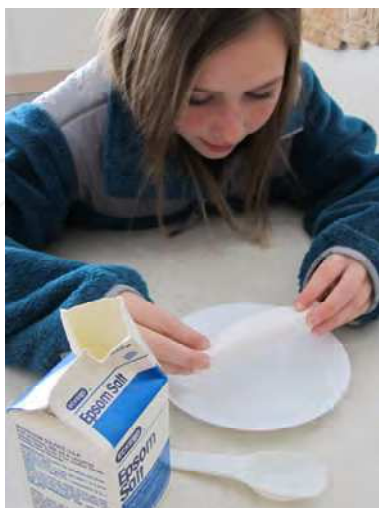
Fig. 6. A middle school student (US grade 7) uses the TOPS Learning Systems (n.d.) petrified paper activity to replicate the fossilization of wood.

Because not all teachers have direct access to petrified wood samples, we introduced and field-tested a simple activity to mimic the fossilization process that involved Epsom salts and a paper towel. We provided teachers with a simple laboratory procedure from TOPS Learning Systems (n.d.). On a small plate, 14.7 cm 3 of MgSO 4 (one level US tablespoon) is dissolved in 29.6 ml (2 level US tablespoons) water. A paper towel is folded into quarters, and then rolled up loosely to form the “log.” This paper log is placed in the salt mixture, and allowed to dry over time. The salt solution is drawn into the paper towel log, and the MgSO 4 precipitates as the log dries. We previously enlisted middle school students (Fig. 6)