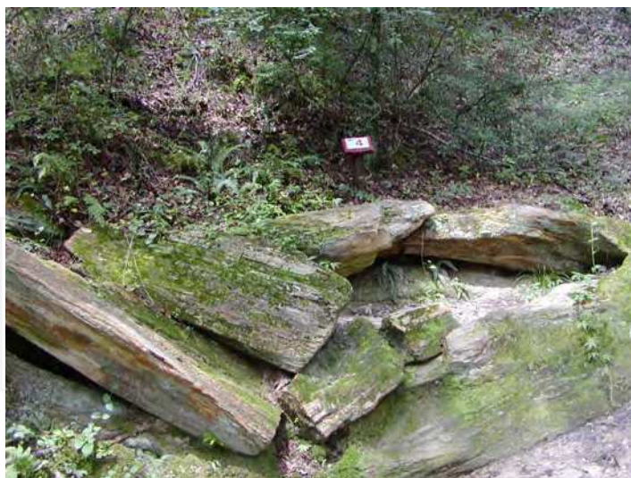
Fig. 1. The Mississippi Petrified Forest in Flora, MS has the largest public display of petrified wood east of the Mississippi River in the US. Signage is minimal at the site, but visitors are provided a brochure, which offers descriptions of the numbered waypoints. The fossilized wood on display is Oligocene in age (30 million years old).

We identified several opportunities to learn important scientific constructs in these informal learning environments, but noted that geologic time was not emphasized or was avoided on the self-guided trails. Likewise, scientific explanations of the formation of petrified wood were missing, partial, or incorrect. However, opportunities existed to help the public visualize how the current location differed from the past paleoenvironment in which the fossilized trees originally lived, and how scientists arrived at the ages for the fossilized wood specimens preserved at each site. A context of the displayed fossilized trees within a larger context of plant evolution would have been informative and helpful.