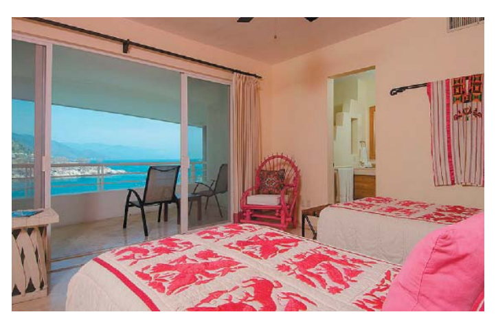
Visit us online at www.villasdeoro.com Villas de Oro Copywright © 2005 All Rights Reserved