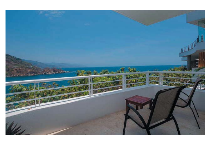
Visit us online at www.villasdeoro.com Villas de Oro Copywright © 2005 All Rights Reserved