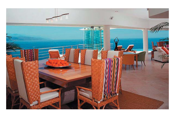
Visit us online at www.villasdeoro.com Villas de Oro Copywright © 2005 All Rights Reserved

$2,400 HIGH - 1 Nov. - 30 Apr. - 6 Bedrooms. $1,800 LOW - 1 May - 31 Oct. - Max.12 People.