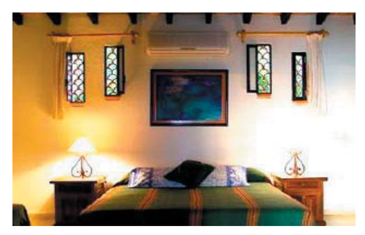
Visit us online at www.villasdeoro.com Villas de Oro Copywright © 2005 All Rights Reserved

This recently remodeled villa is located just one and a half miles south of the city in the Colonial Conchas Chinas residential area and fifty yards from a beautiful sandy beach. Villa la Villita is offering a total of ten bedrooms each with it's own private bathroom and may be rented with a minimum of 7 bedrooms. There are seven bedrooms in the main villa plus three one bedroom casitas. The large poolside courtyard is ideal for sunbathing or dining near the outdoor BBQ area. Located on the rooftop terrace is a palapa covered bar, perfect for viewing the spectacular sunsets and Banderas Bay. The Villa la Villita is ideal for large groups, family reunions and weddings. Amenities include a large jacuzzi, A/C, and a full-time staff.