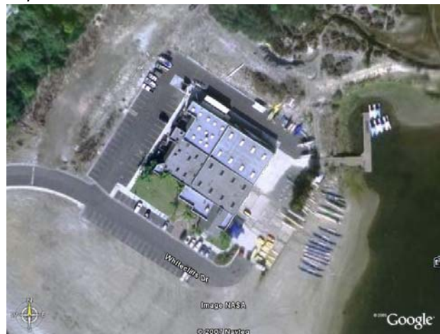
Facility has doubled in size since opening

Initiated by: Individual paddlers Opened date and facility: 19__, 8,000 square foot metal building Land ownership: federal agency Improvements owned by: nonprofit Operations: Non-profit with income from participating clubs and Parks & Rec programming. All coaching and educational personnel are employees of the center. Facilities: the works. Budget: revenues generated by fees, programs, special events, etc. and boat rentals.