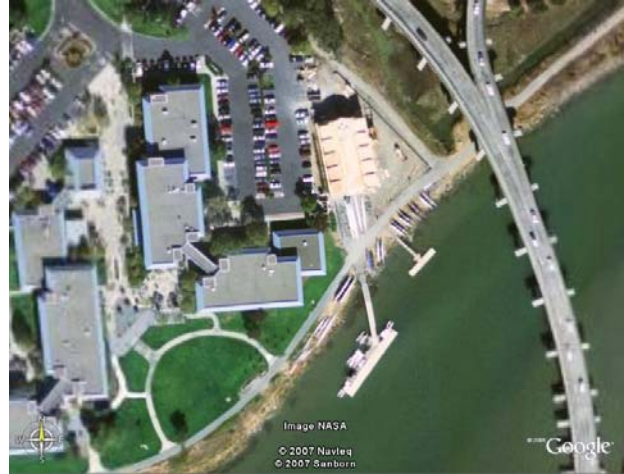
Light-colored roof is boathouse

Facilities: low-float dock, showers, weight room, storage, trailer parking