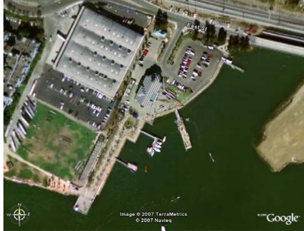
JLAC is to right of large building

Initiated by: Parks and Recreation department Land ownership: public agency Improvements owned by: public Operations: Parks & Rec Department Facilities: the works