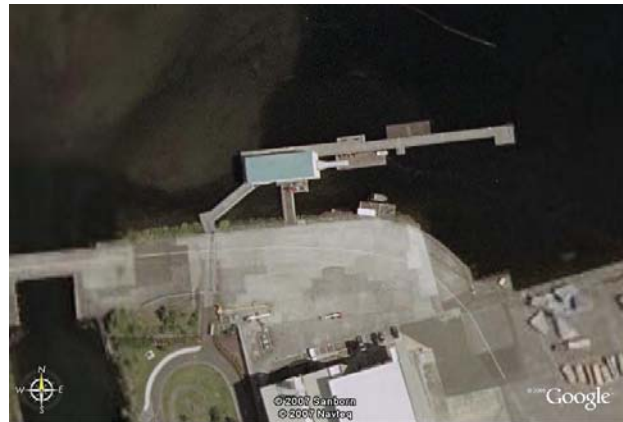
Access to low-float dock is through building

Initiated by: Parks and Recreation department Current size: Opened date and facility: 19__ Land ownership: Boeing Corp deeded former hovercraft port to Parks & Recreation Department Improvements owned by: public Operations: Private concessionaire Facilities: Showers, retail store.