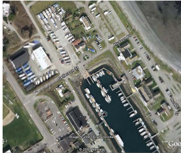
Red building in center is chandlery

Facilities: plans major waterfront development with multi-sport user facility and boat storage