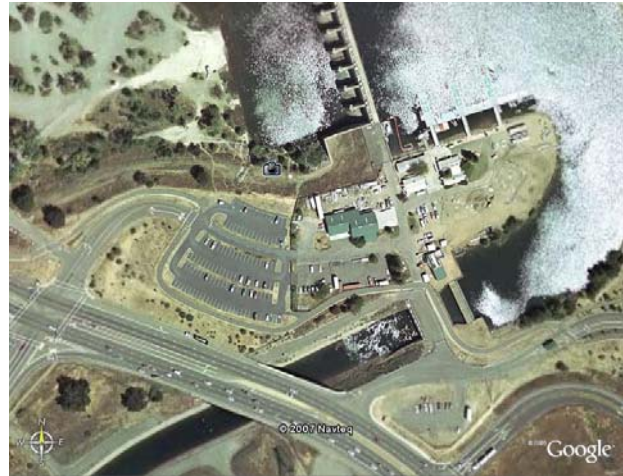
Power, sail, and human-powered craft share this complex

Budget: $1.5 million, with $1.4 million in revenues generated by fees, programs, special events, etc. and $130,000 is generated by boat rentals.