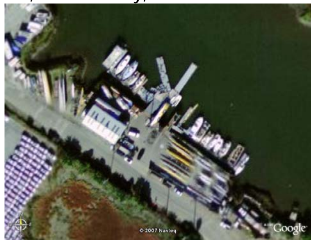
Berths for private power boats plus open storage

Facilities: weight room, shower, boat storage, berths