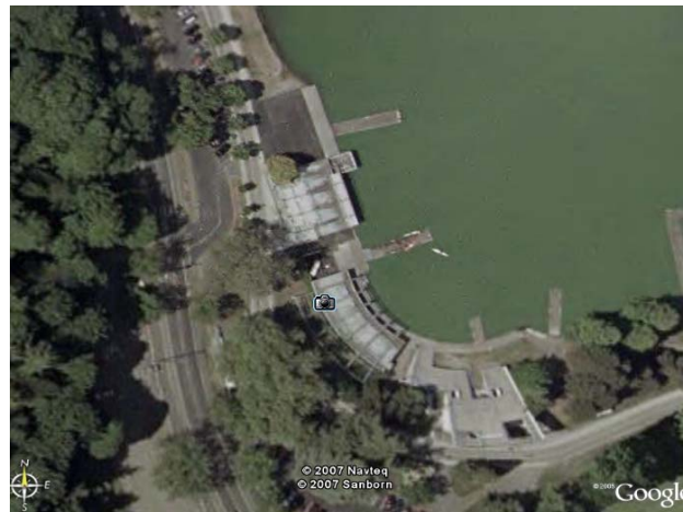
Building is shared with other parks&rec programs