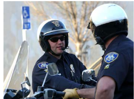
Petaluma Donut Patrol