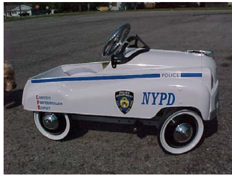
NYPD Pursuit Driving Course