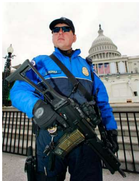
Combo Car/Weapon Class