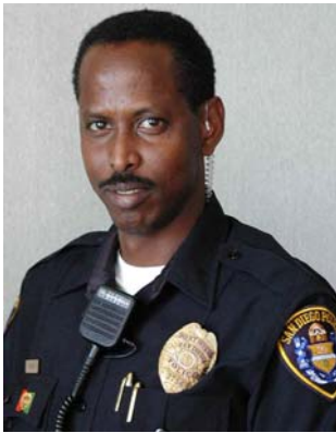
Freedom Drivers School

You should know that under California State Statue 543-9493-39942-93d-7, you are required to attend a course offered by one of our driving instructors. You are free to choose a course from any of the following: