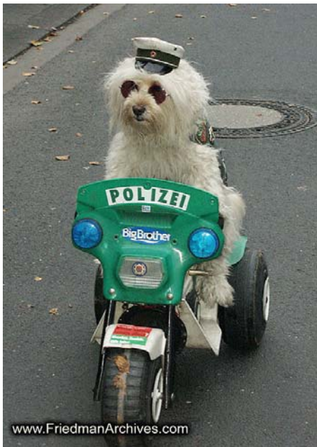
Finky, Deutsche Auto Gelernen