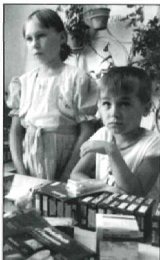
Children in Ukraine have no insulin.